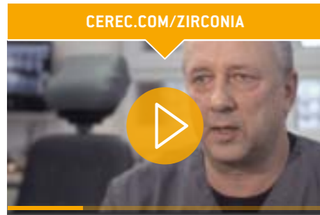
Working with full contour zirconia: Listen to professional opinions in our video interview.

Zirconium oxide is a high-performance material in great demand, which CEREC combines with a workflow optimally suited to the material. It has a high degree of flexural strength and is biocompatible, allowing tooth-conserving preparations for fully anatomical restorations. CEREC makes fully anatomical zirconium oxide restorations in a single visit possible – and thus easier, faster, and more economical than ever.